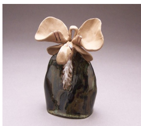
Loken Pottery Barb & Neal Loken Farmingdale