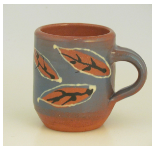
Whitefield Pottery Libbey Seigars, Whitefield

Tour the kilns (and gardens!) meet the artists, peek into the kiln, see wheel demos, and shop for handmade pottery. Use this handy map to plan your trip!